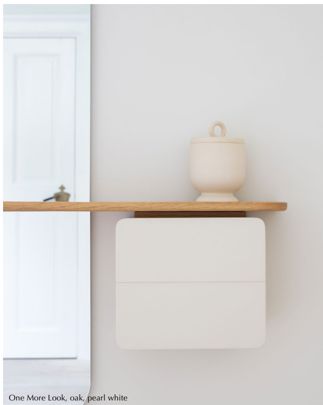
One More Look, oak, pearl white