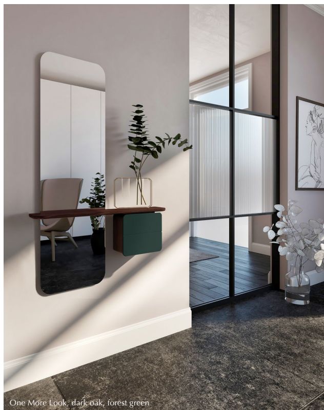
One More Look, dark oak, forest green

One More Look is a light and airy mirror with a minimalistic Scandinavian feel and a number of added functions to meet the everyday needs of urban living.