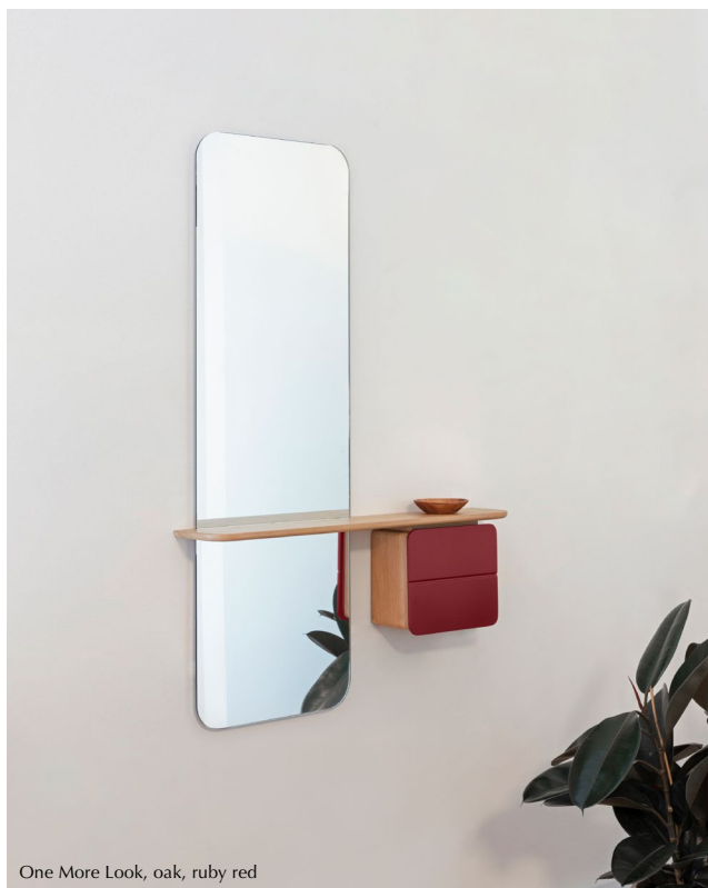
One More Look, oak, ruby red