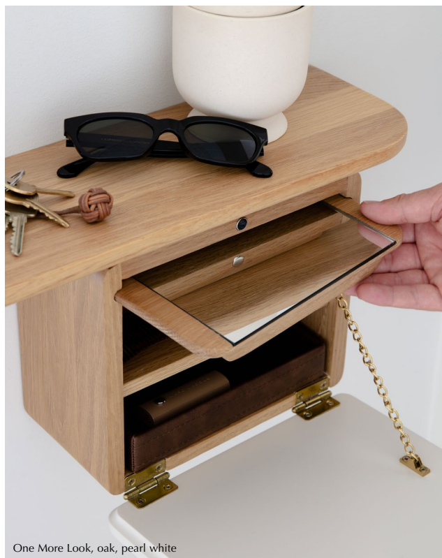
One More Look, oak, pearl white