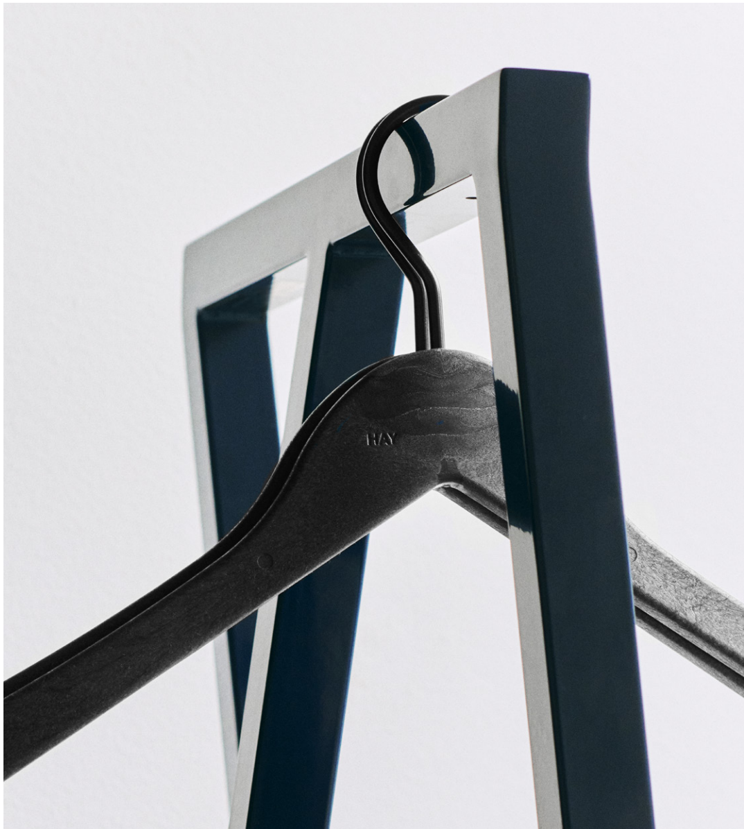
Loop Stand Hall | Deep blue powder coated steel