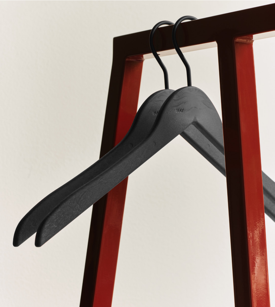
Loop Stand Hall | Maroon red powder coated steel