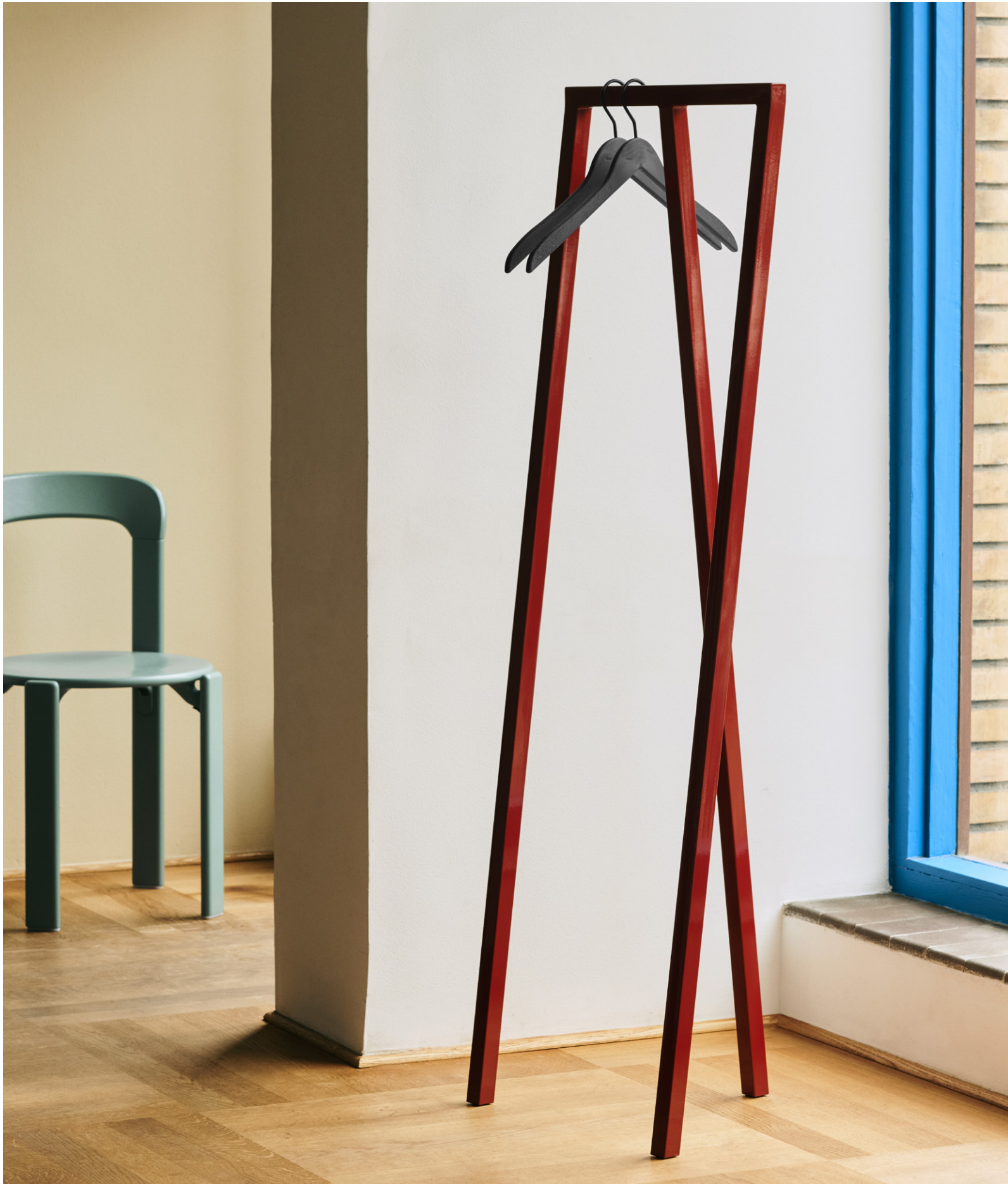
Loop Stand Hall | Maroon red powder coated steel