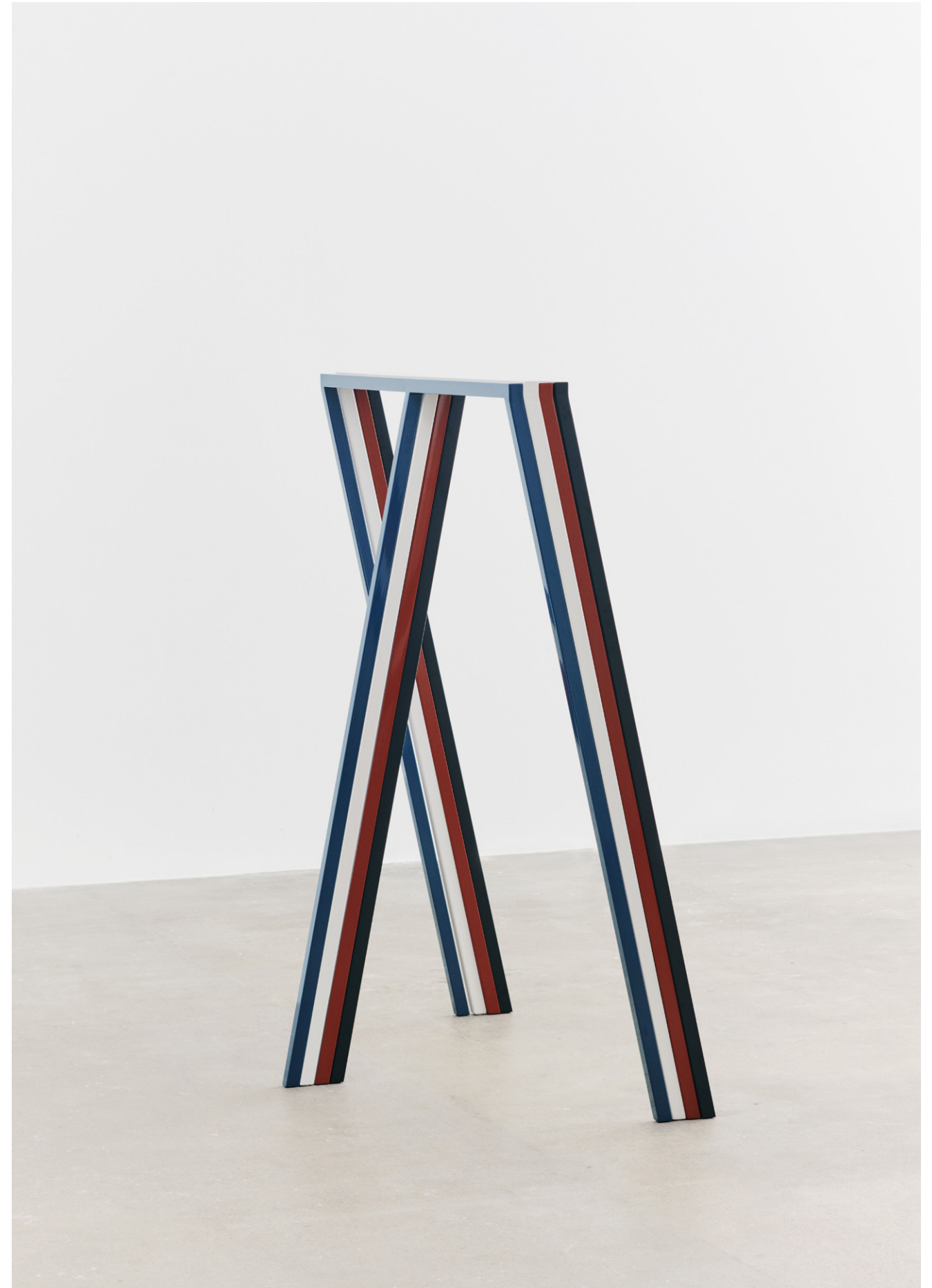
Loop Stand Wardrobe Family