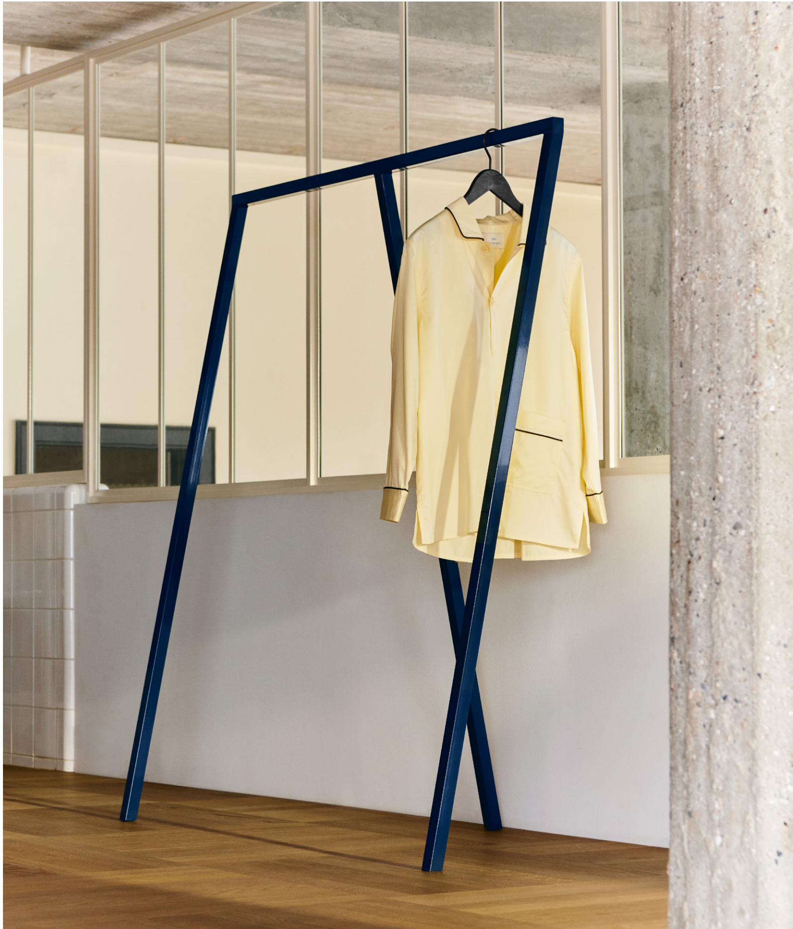
Loop Stand Wardrobe | Deep blue powder coated steel